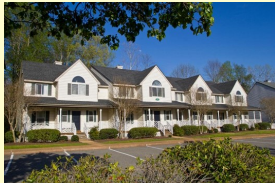
Historic Powhatan Resort