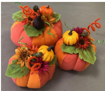
Soft Sculpture Fabric Pumpkins new for Fall Fest 2021

After Fall Fest 2021 is over, we shall be returning to our more relaxed schedule of meeting on the first, third, and fifth Thursdays of each month. These dates fall on Oct. 7 and 21 this year. All ladies of the parish are invited to join us at any of our meetings. We begin each meeting at 9:30 with a member of the clergy leading us in Morning Prayer, and we finish by noon. Please come to enjoy a Thursday morning of