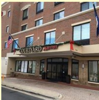
Courtyard by Marriott in Historic Downtown Fredericksburg