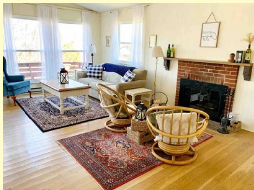
Hiker's Hideaway Romantic Cabin