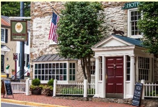
The Red Fox Inn

22. A handsomely matted and framed Pen and Ink Print of Aquia Church