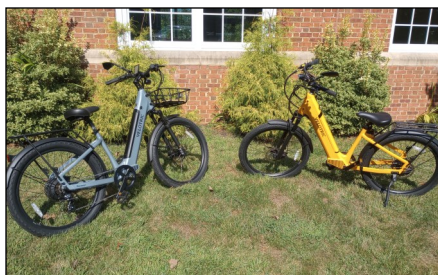
Above: Two Velotric Ebikes Right: Pelican Argo 100X Kayak, oars, and a woman's life vest